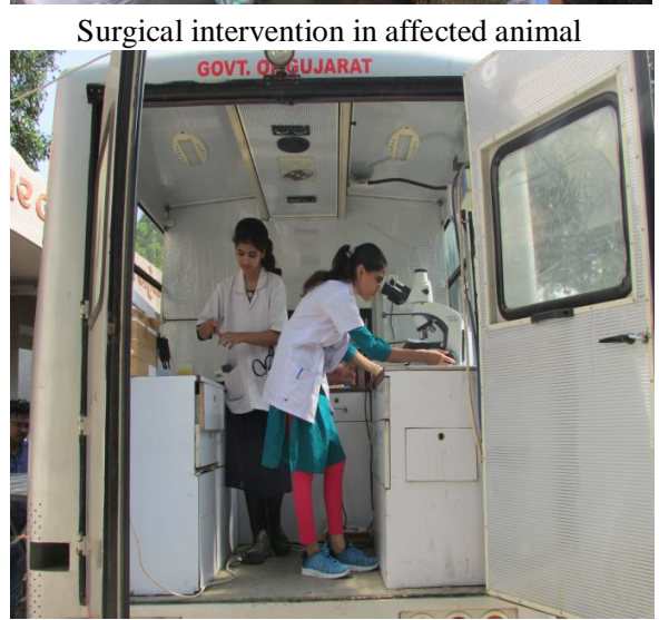
Laboratory setup in camp van