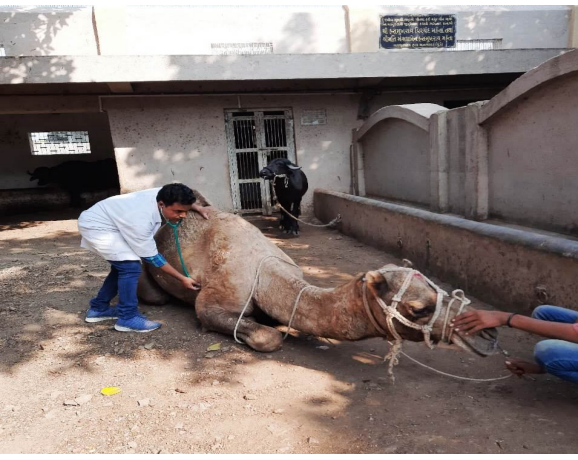
Clinical examination of Camel during camp