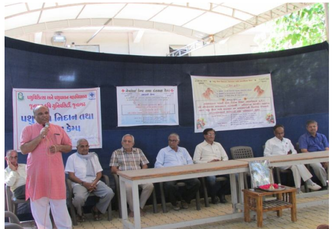
Innauguration of camp at Shree Bhanvad Mahajan Panjarapol Gaushala