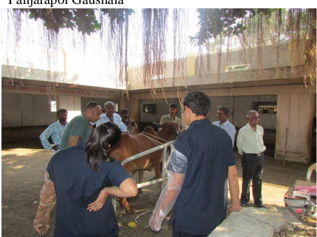
Gynecological examination of cow